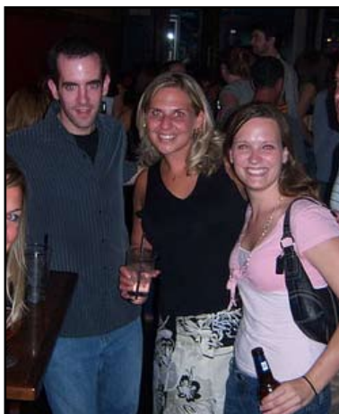
FYI, practices are what we call "happy hours."

Talk to your captain about trading you to another team. Trades are allowed as long as shirts are swapped and everyone is okay with the moves.