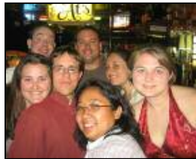
FYI, practices are what we call happy hours.

If you log in in to the website (top of the homepage) you will see contact info for your Captain as well as everyone else on your team. Happy stalking!